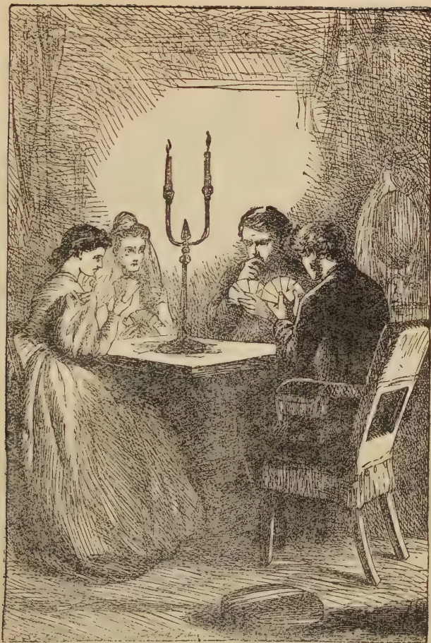
A RUBBER AT MISS HAVISHAM'S.